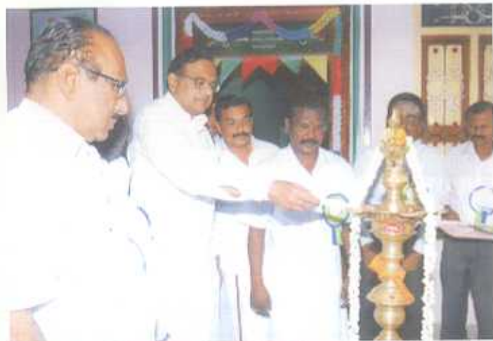
Shri. P.Chidambaram, Hon'ble Union Minister for Home Affairs inaugurating the Sub-Regional Office of Coir Board.

On the occasion, Shri Chidambaram said that the coir industry of Tamil Nadu,