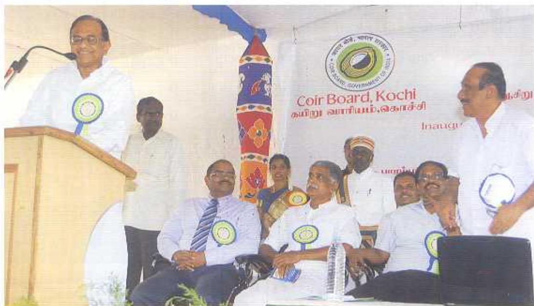
Shri. P.Chidambaram, Hon'ble Union Minister for Home Affairs delivering his inaugural address

Shri V.S.Vijayaraghavan, Ex-MP, Chairman Coir Board presided over the function organized for inauguration of the Sub-Regional Office of the Board in Sivagangai and the Common Facility Centre. Presiding over the function, Shri .Vijayaraghavan said that the Common Facility Centre established under the SFURTI Scheme was only a beginning of the modernisation of the coir industry in Tamil Nadu. Shri.P.Selvam, IAS, Secretary to the Govt. of Tamil Nadu offered felicitations on the occasion. Shri. M.Kumara Raja, Secretary Coir Board welcomed the participants.