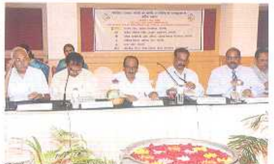
Views of sittings of the Parliamentary Committees